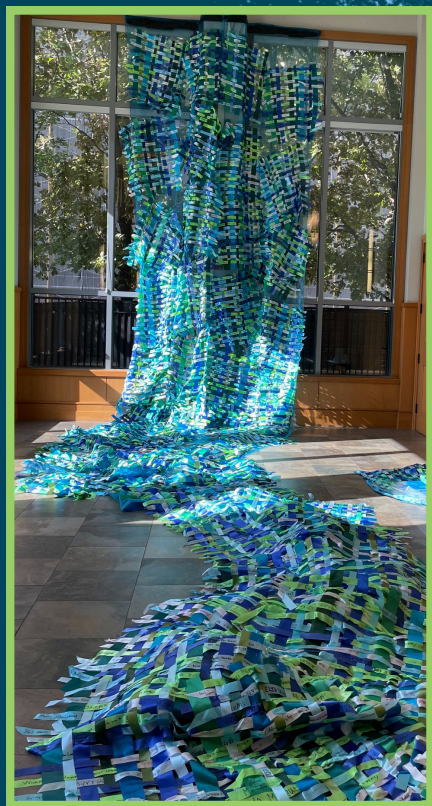
River of Time on exhibit at First Presbyterian Dallas